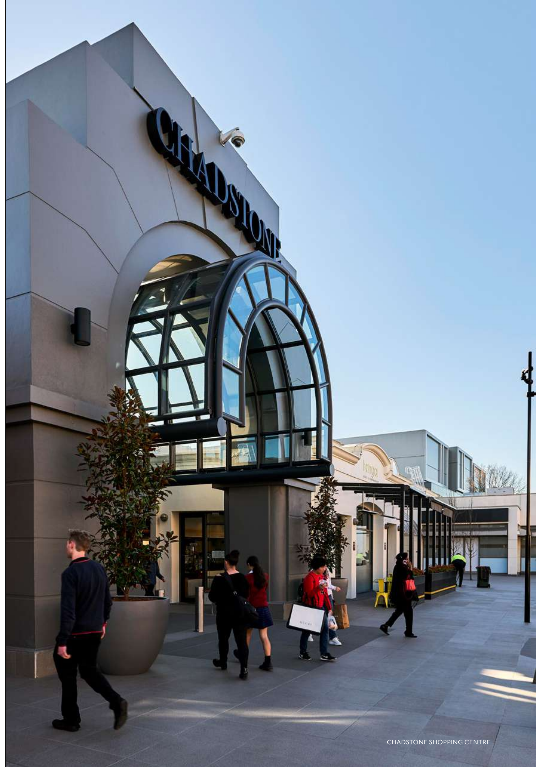
CHADSTONE SHOPPING CENTRE