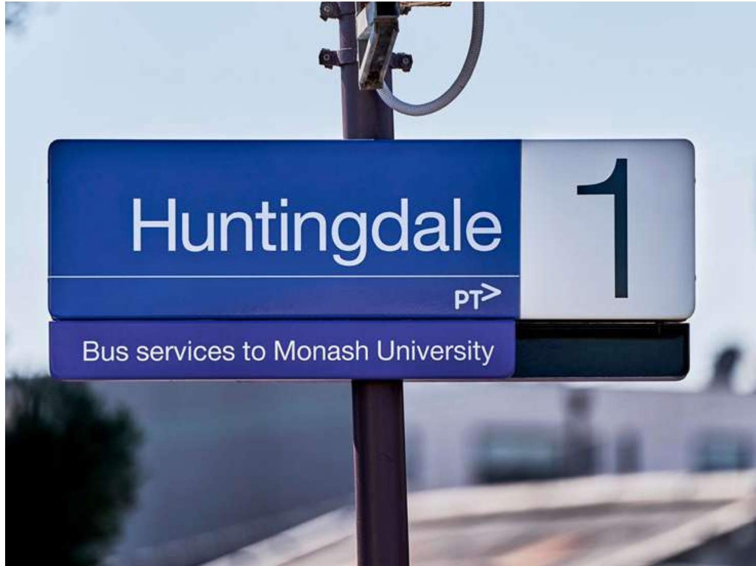
HUNTINGDALE TRAIN STATION