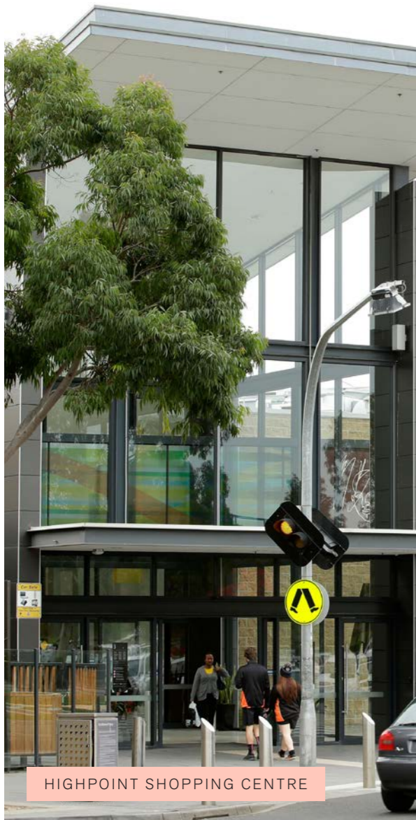
HIGHPOINT SHOPPING CENTRE