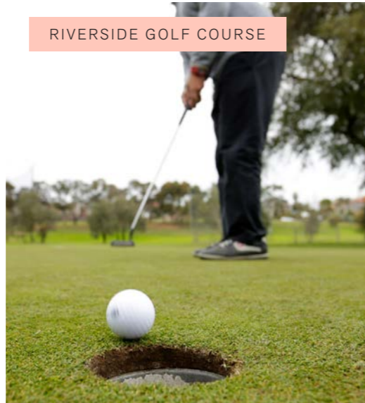
RIVERSIDE GOLF COURSE